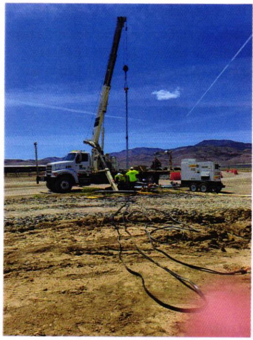
Friday work (up size the crane is working)