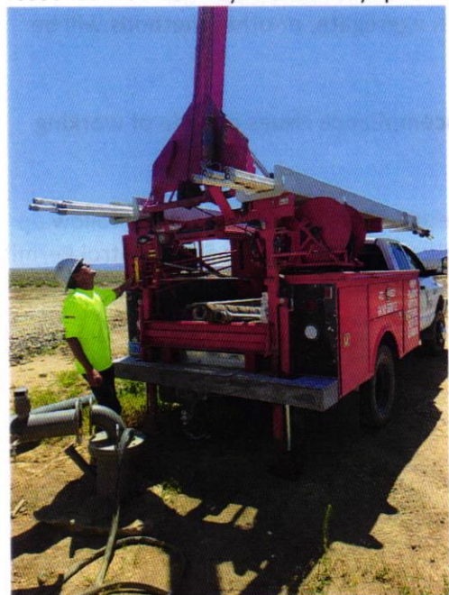
Saturday work (Crane to small)

Please let me know if you have any questions.