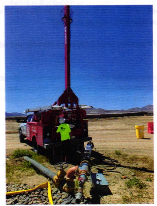
Saturday work (Crane to small)